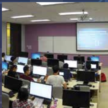
Applied Statistics Laboratory 應用統計實驗室