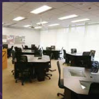
Decision Sciences Technology Laboratory 決策科學科技實驗室