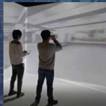
Virtual Reality and Big Data Analytics Laboratory 虛擬實境及大數據分析研究實驗室