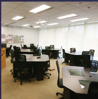
Decision Sciences Technology Laboratory 决策科学科技实验室