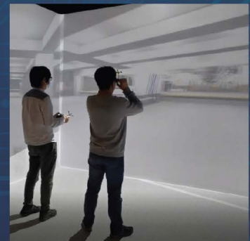
Virtual Reality and Big Data Analytics Laboratory 虚拟现实及大数据分析研究实验室