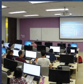
Applied Statistics Laboratory 应用统计实验室